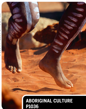
ABORIGINAL CULTURE P1036