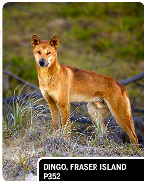
DINGO, FRASER ISLAND P352