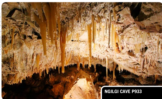
NGILGI CAVE P933

Meningie & Coorong National Park . . . 774