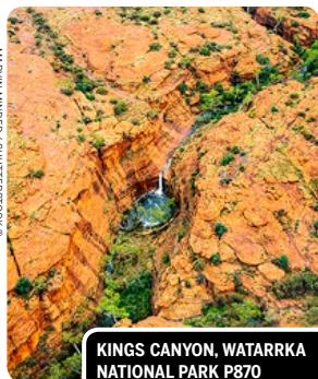
KINGS CANYON, WATARRKA NATIONAL PARK P870