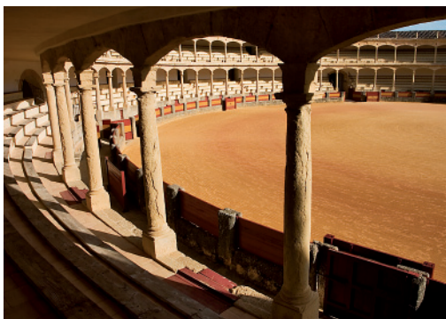
KARL B. AGNEWELL

LAS ALPUJARRAS Whitewashed villages set against a mountain backdrop (p275).