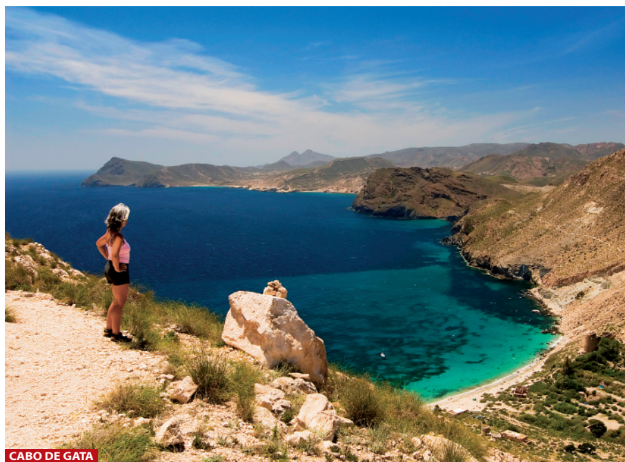
CABO DE GATA