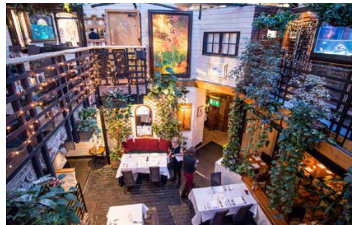
Ubiquitous Chip