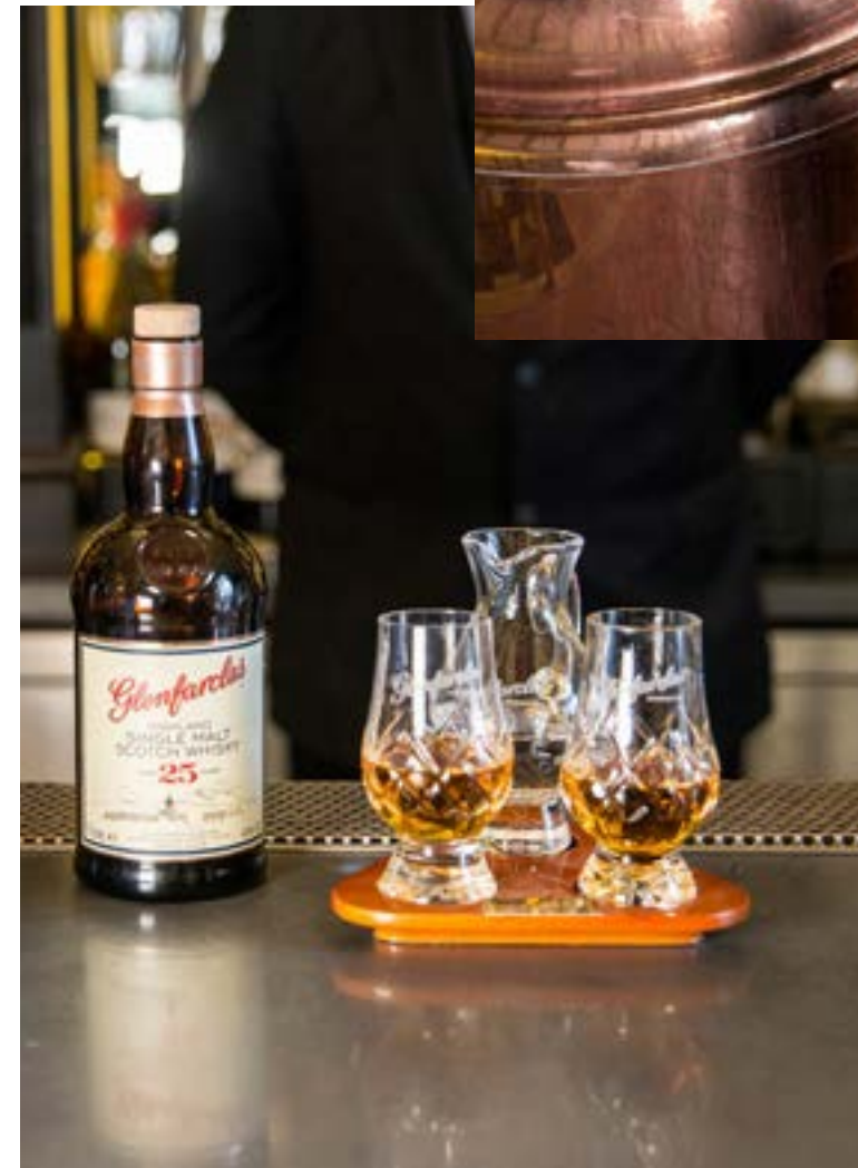
Bottle of Glenfarclas single malt Scotch with tumblers and decanter at Hutchesons Bar and Brasserie