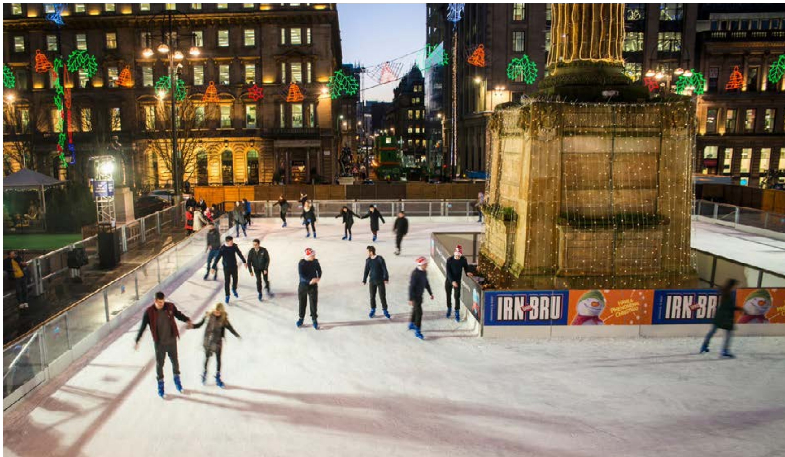
Ice skaters in George Sq