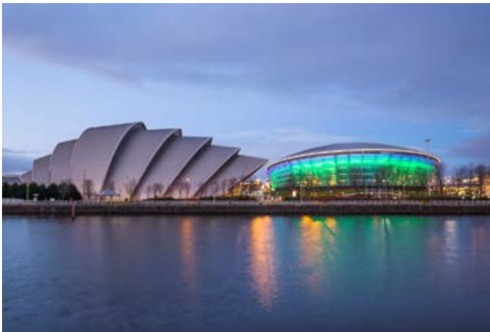
View of the Clyde Auditorium (the 'Armadillo')