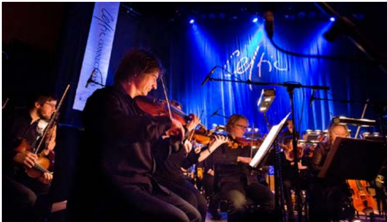
Celtic Connections, Royal Concert Hall, Glasgow