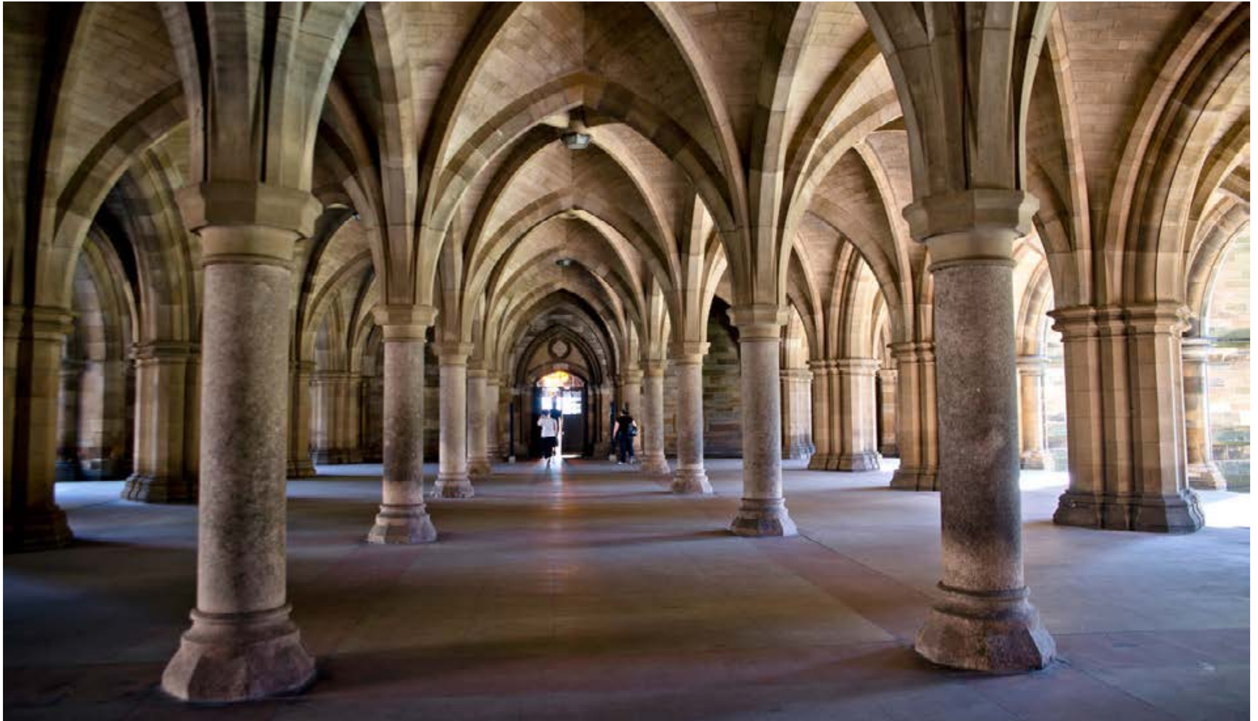
Glasgow University cloisters