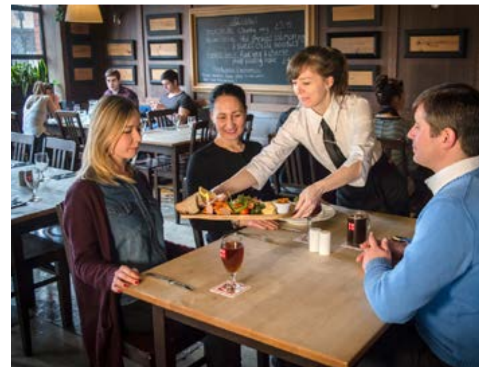
Diners at West Brewery Bar and Restaurant

Two bars, including the cute 'Wee Pub' down the side alley, offer plenty of drinking pleasure. There's always something going on at the Chip – check the website for upcoming events.