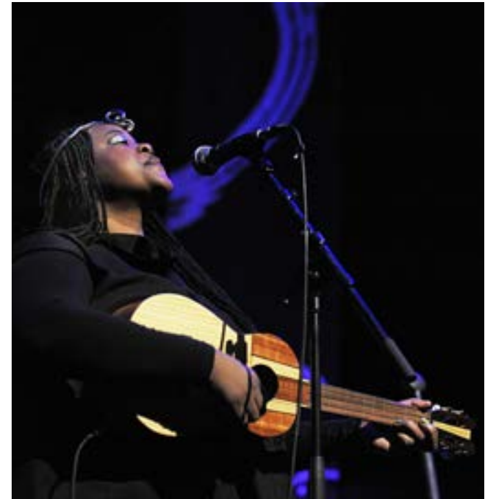
Eska at Celtic Connections 2016

Pages 78–9: Kelvingrove Art Gallery & Museum