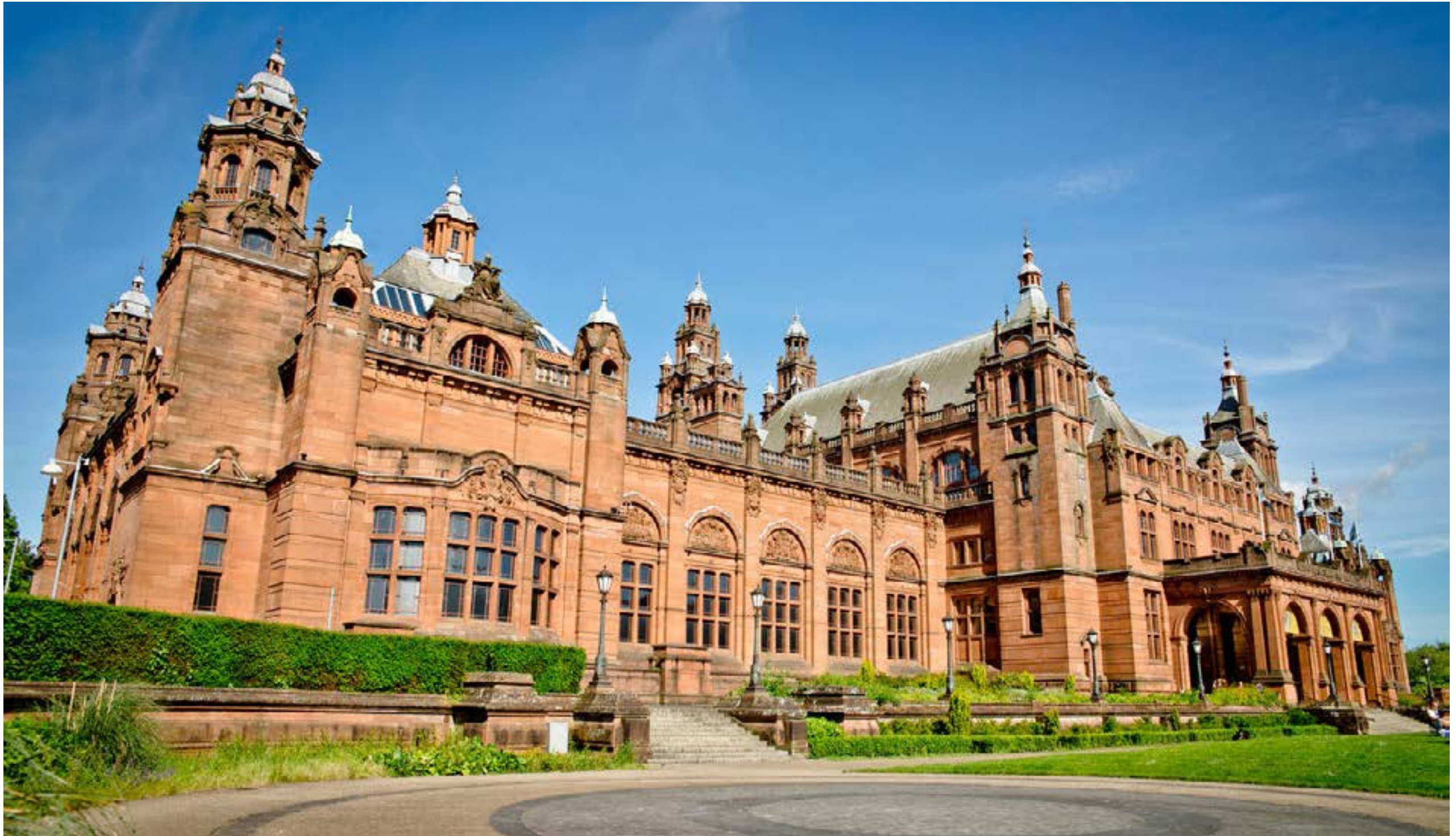
Kelvingrove Art Gallery & Museum