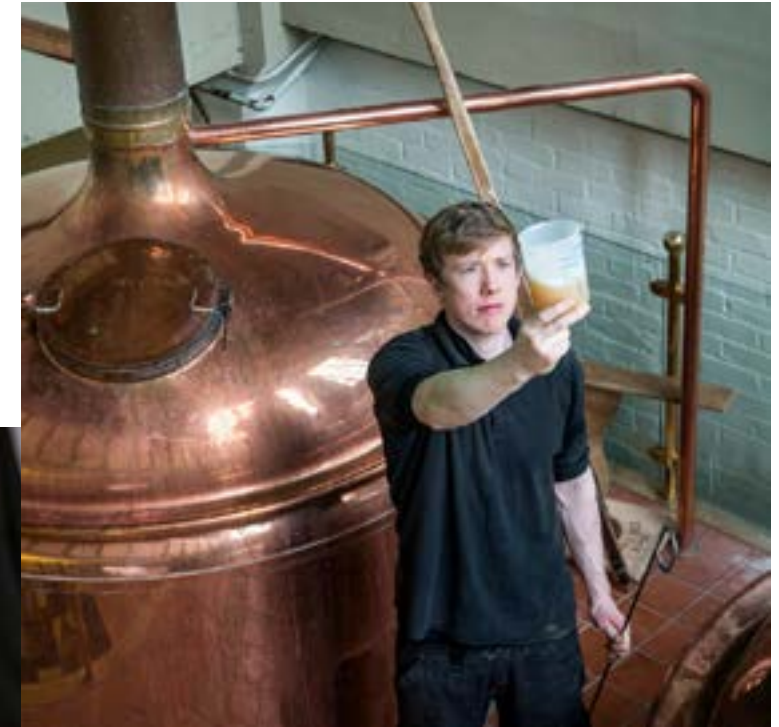
Brewer at West Brewery Bar and Restaurant