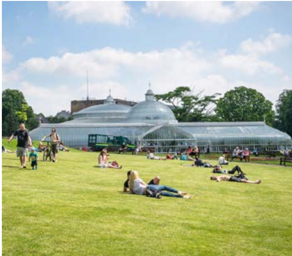
Kibble Palace, Glasgow