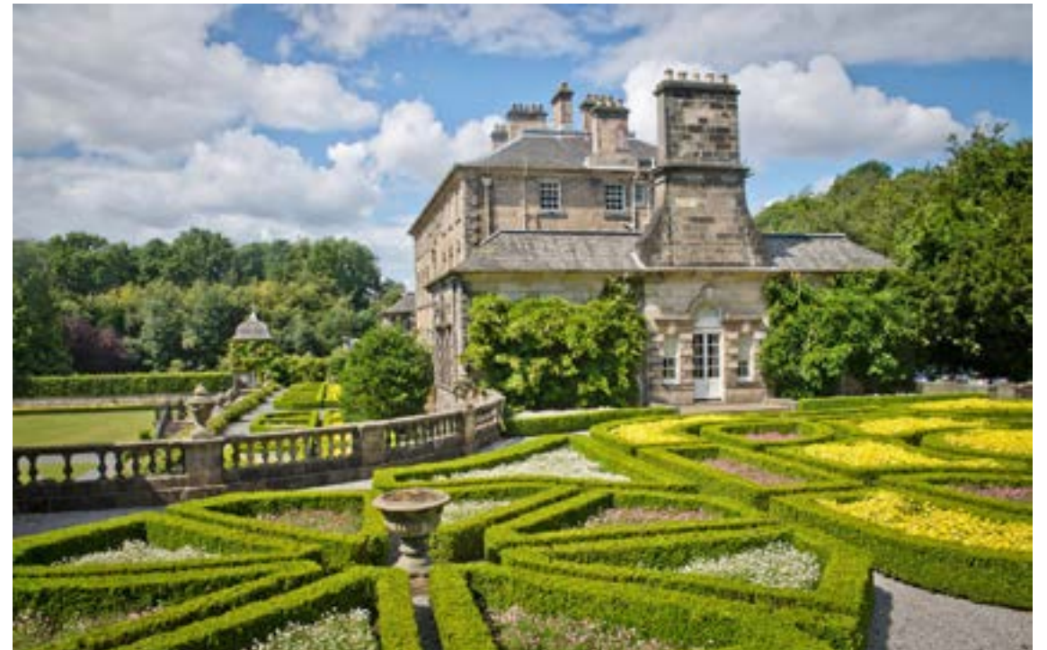
Pollok House