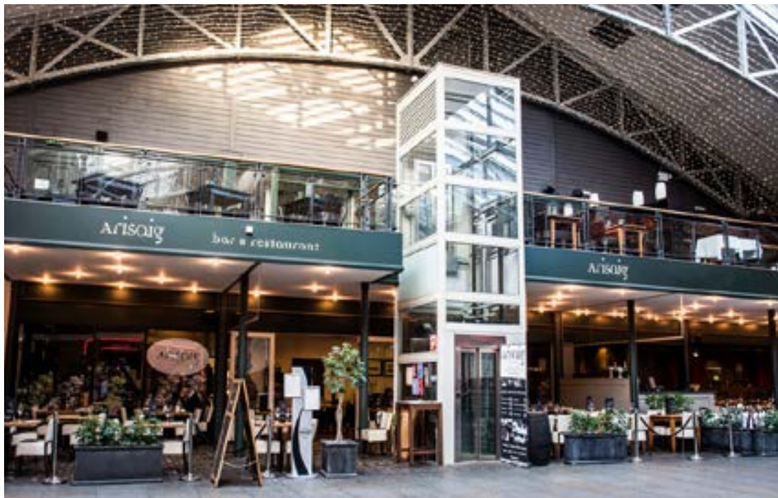
Arisaig bar and restaurant