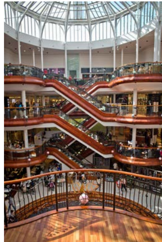
Princes Square shopping centre