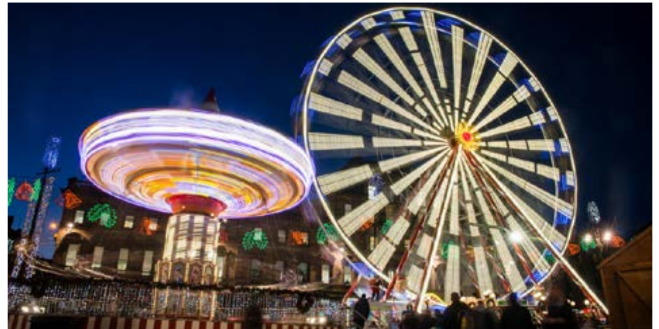
George Sq at Christmastime