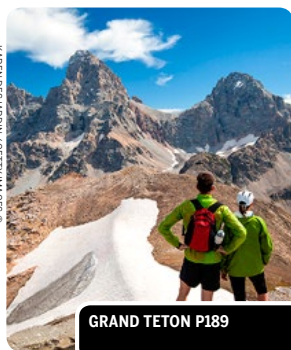
GRAND TETON P189