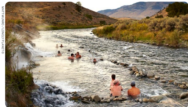
Right: Boiling River (p90), Mammoth Country