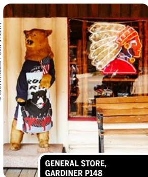
GENERAL STORE, GARDINER P148