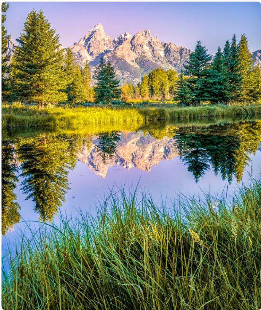
Above: Schwabacher's Landing (p197)