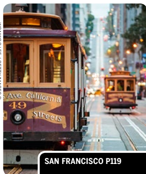
SAN FRANCISCO P119