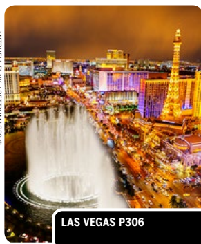
LAS VEGAS P306