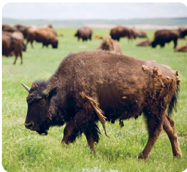
Bison Badlands National Park (Trip 26)