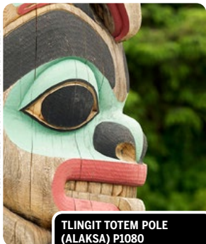
TLINGIT TOTEM POLE (ALASKA) P1080