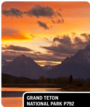
GRAND TETON NATIONAL PARK P792