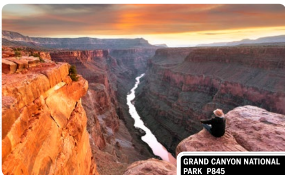
GRAND CANYON NATIONAL PARK P845