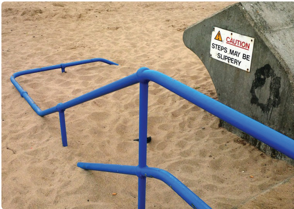
Safety railing for large groundhogs. Newbiggin-by-the-Sea, UK by Alastair Speight