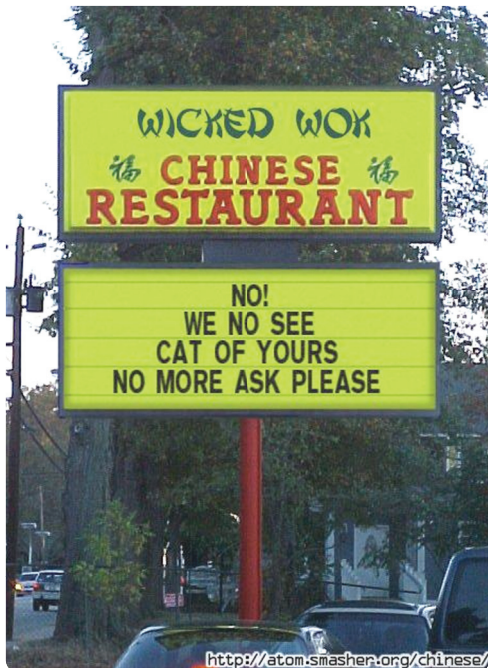
Don't worry... it tastes like chicken. Ontario, Canada by Jonah