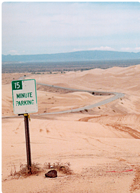
Your fifteen minutes starts right now. Glamis, California, USA