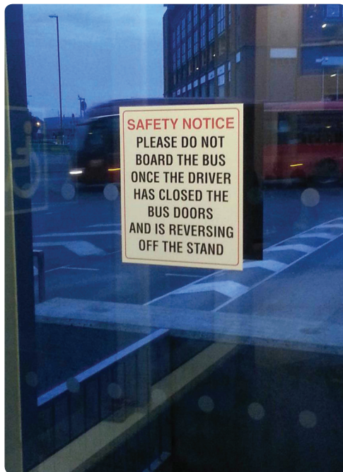
But you may cling to the outside. Derby, England