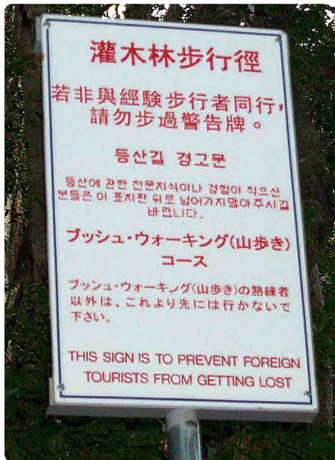
Finally, helpful tourist information. China