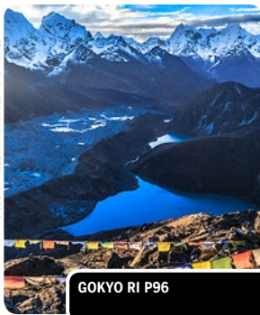
GOKYO RI P96