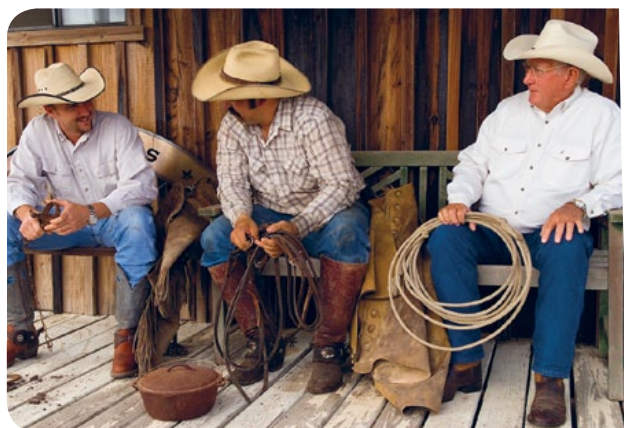
A porch in cowboy country

You can tell everyone you visited a notorious Texas brothel at this only slightly risqué stop on Trip 24