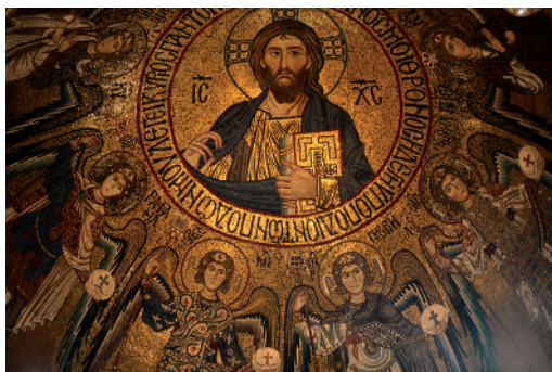
JOHN ELK III