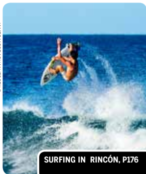
SURFING IN RINCÓN, P176