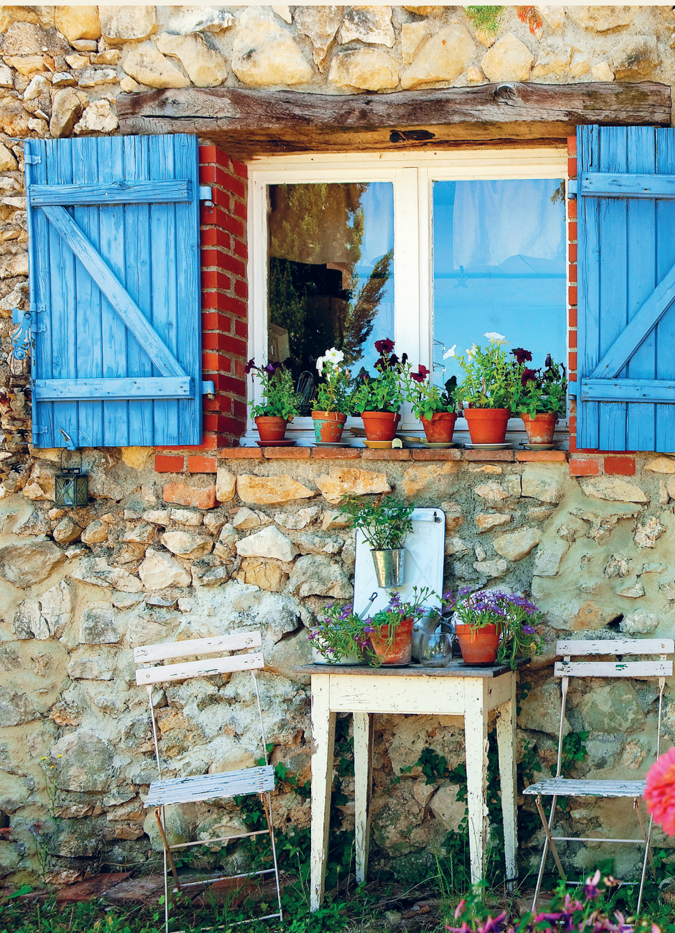
House in Vaucluse