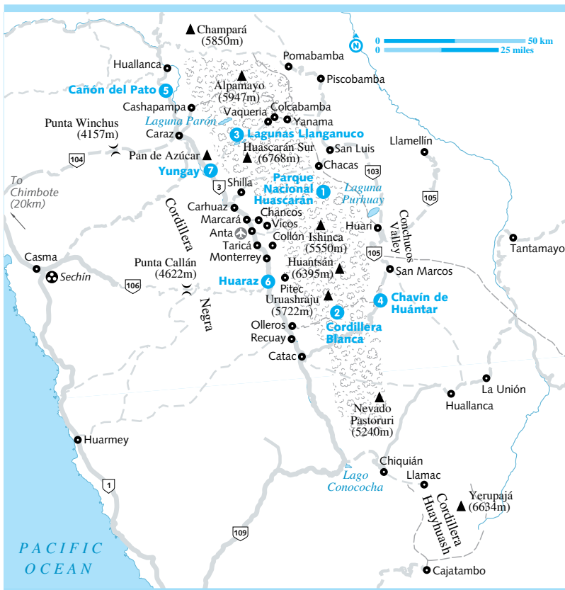
HUARAZ & THE CORDILLERAS

This is first and foremost a trekking metropolis. During the high season the streets