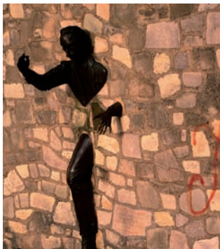
Le Passe Muraille by Jean Marais, rue Norvins

Find out more about Paris Île-de-France's events on www.new-paris-idf.com .