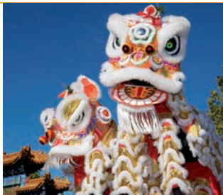
Chinese New Year celebrations