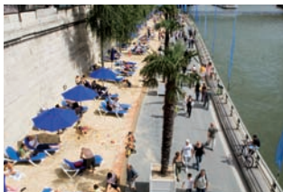
Sunbathers, Paris Plages