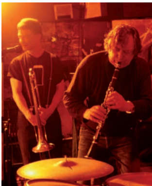
Jazz musicians, Le Caveau de la Huchette

At the end of August, rock music hits the Parc de Saint-Cloud with three days of concerts