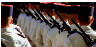
Soldiers, Bastille Day parade

A classical and world-music festival with more than 20 concerts in the Basilique de Saint-Denis and other venues around the town.