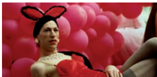
Marche des Fiertés (Gay Pride) parade

Centre National de la Danse (p136) in Pantin is one of the venues hosting the festival.