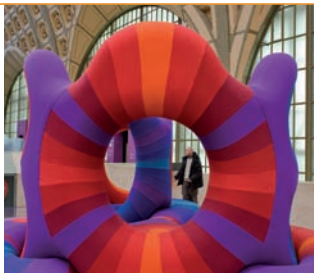
Art installation in Orsay Museum

genres both in the Grande Halle and its surrounding gardens.