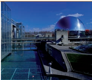
La Géode, Parc de la Villette