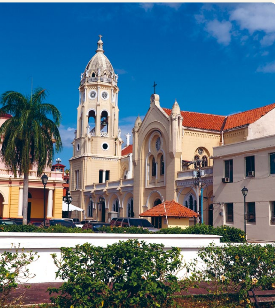
Casco Viejo (p45), Panama City

of avid birders. Climb a canopy tower to search for toucans, capuchin monkeys and sloths or paddle a kayak on Lago Gatún alongside howler monkeys and sunbathing crocodiles.