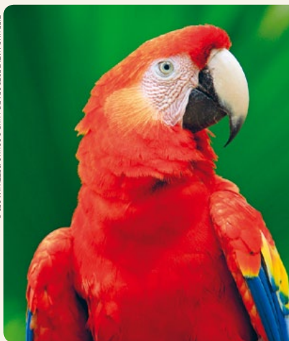
Top: Kuna Yala (p221) Bottom: Scarlet macaw