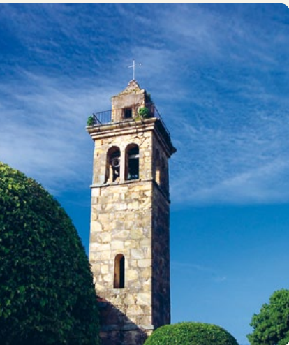
Top: Highlands, Coclé Province (p92) Bottom: David (p153), Chiriquí Province