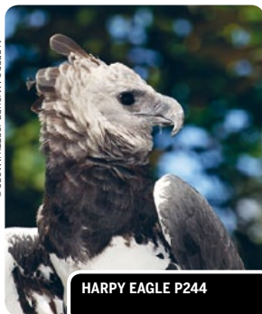
HARPY EAGLE P244