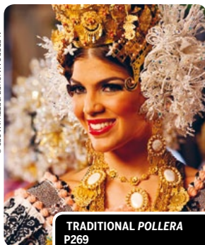
TRADITIONAL POLLERA P269