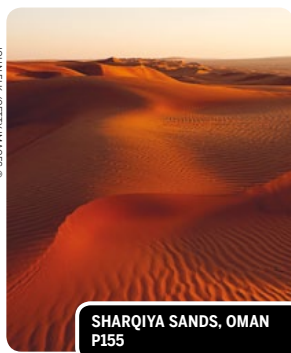
SHARQIYA SANDS, OMAN P155