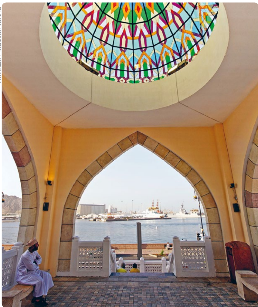
Top: Mutrah Souq (p138), Muscat, Oman Bottom: Royal Opera House Muscat (p127), Oman