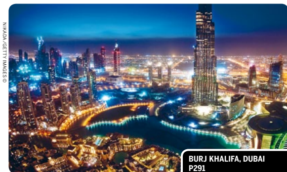
BURJ KHALIFA, DUBAI P291