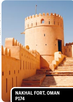
NAKHAL FORT, OMAN P174