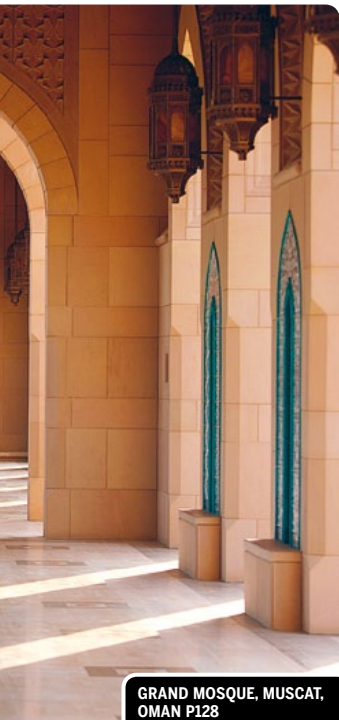
GRAND MOSQUE, MUSCAT, OMAN P128