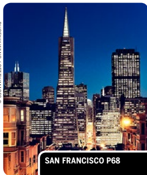
SAN FRANCISCO P68