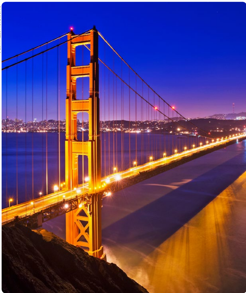
Top: Golden Gate Bridge (p72)