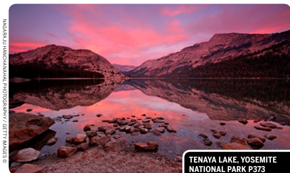
TENAYA LAKE, YOSEMITE NATIONAL PARK P373