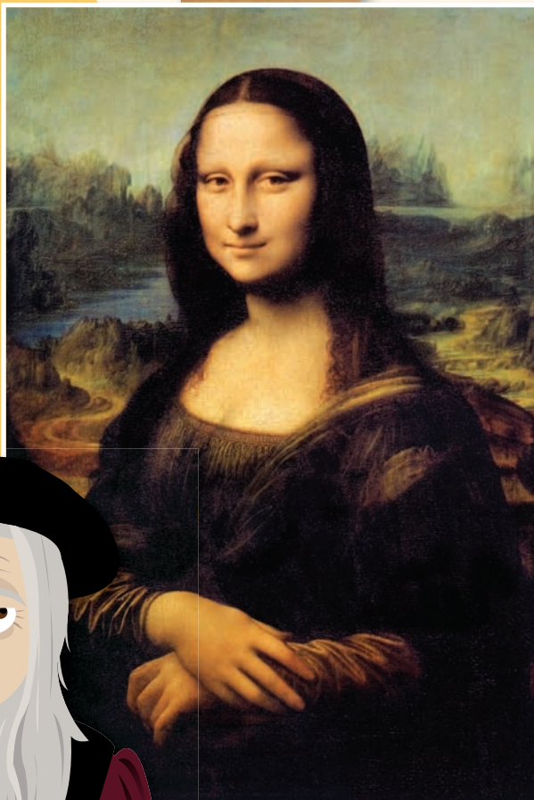
Mona Lisa c.1503–5, LeonardodaVinci

Is it a sad smile or a happy smile? That's the question people ask about Mona Lisa , the most famous painting in the world. The Italian artist Leonardo Da Vinci created this masterpiece over 500 years ago and brought it with him to France. Recent studies show that there are three different versions painted under the one that can be seen today. One version has her hands clutching the arms of the chair instead of in front of her.