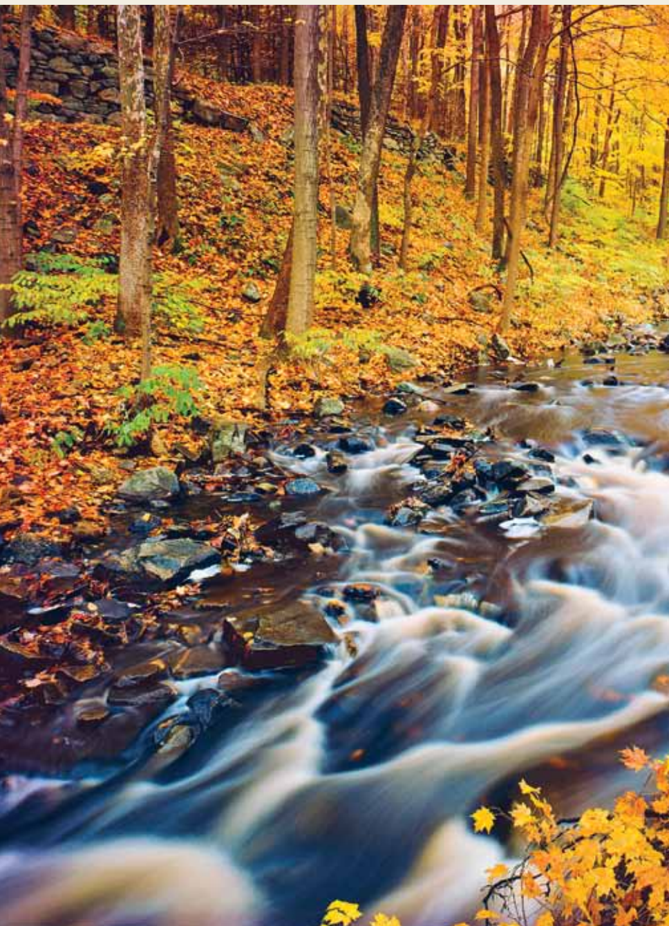
Vermont Green Mountain landscapes are enchanting in autumn