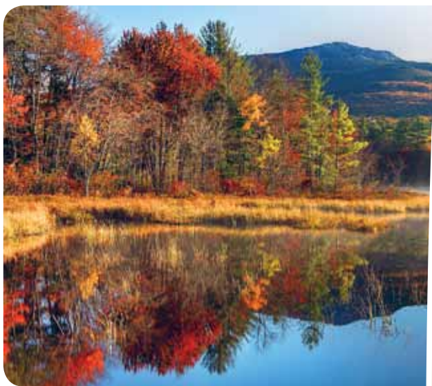
Mt Monadnock (Trip 25)