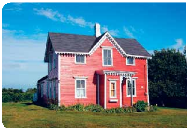
Block Island 'Gingerbread' house (Trip 8)

Watch stylish independent and foreign films in a converted red barn next to Lake Bantam on Trip 12