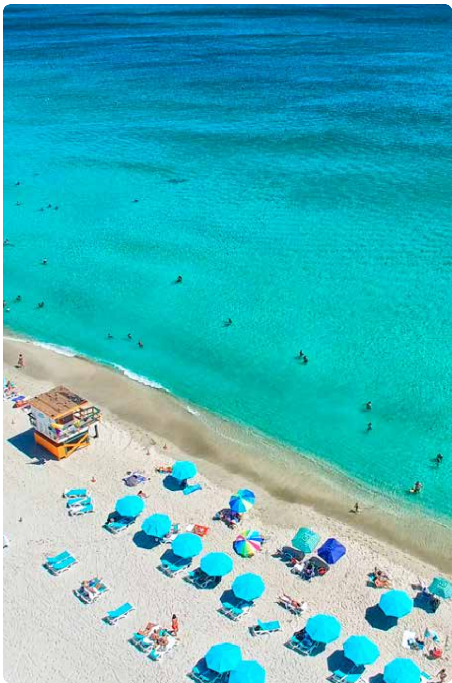
South Beach (p58), Miami