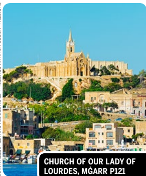
CHURCH OF OUR LADY OF LOURDES, MĠARR P121