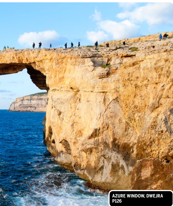
AZURE WINDOW, DWEJRA P126