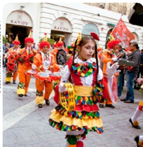
CARNIVAL PROCESSION, VALLETTA P18