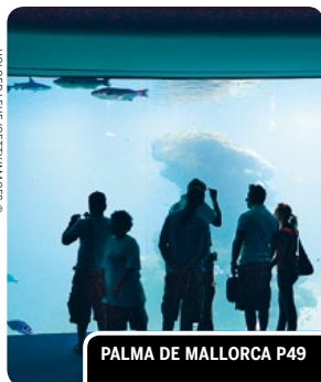
PALMA DE MALLORCA P49