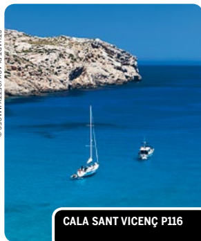
CALA SANT VICENÇ P116