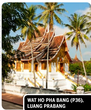
WAT HO PHA BANG (P36), LUANG PRABANG