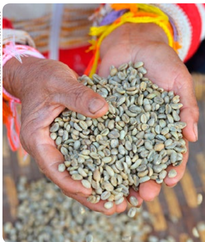
Top: Patuxai monument (p130), Vientiane Bottom: Sun-dried coffee beans, Bolaven Plateau (p219)