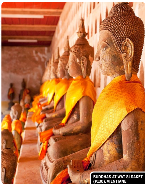
BUDDHAS AT WAT SI SAKET (P130), VIENTIANE