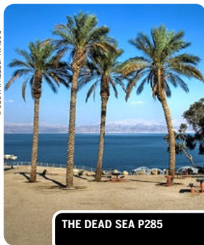
THE DEAD SEA P285