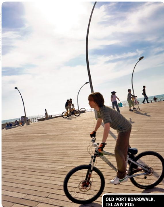
OLD PORT BOARDWALK, TEL AVIV P115