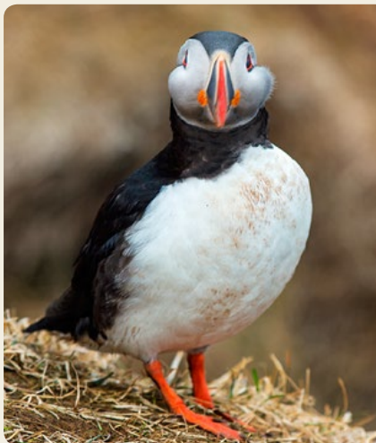
Top: Jökulsárlón (p297)