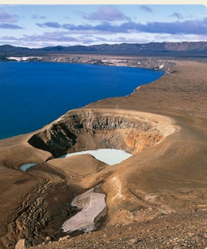
Top: Hikers, Landmannalaugar (p140) Bottom: Óskjuvatn (p316), Askja