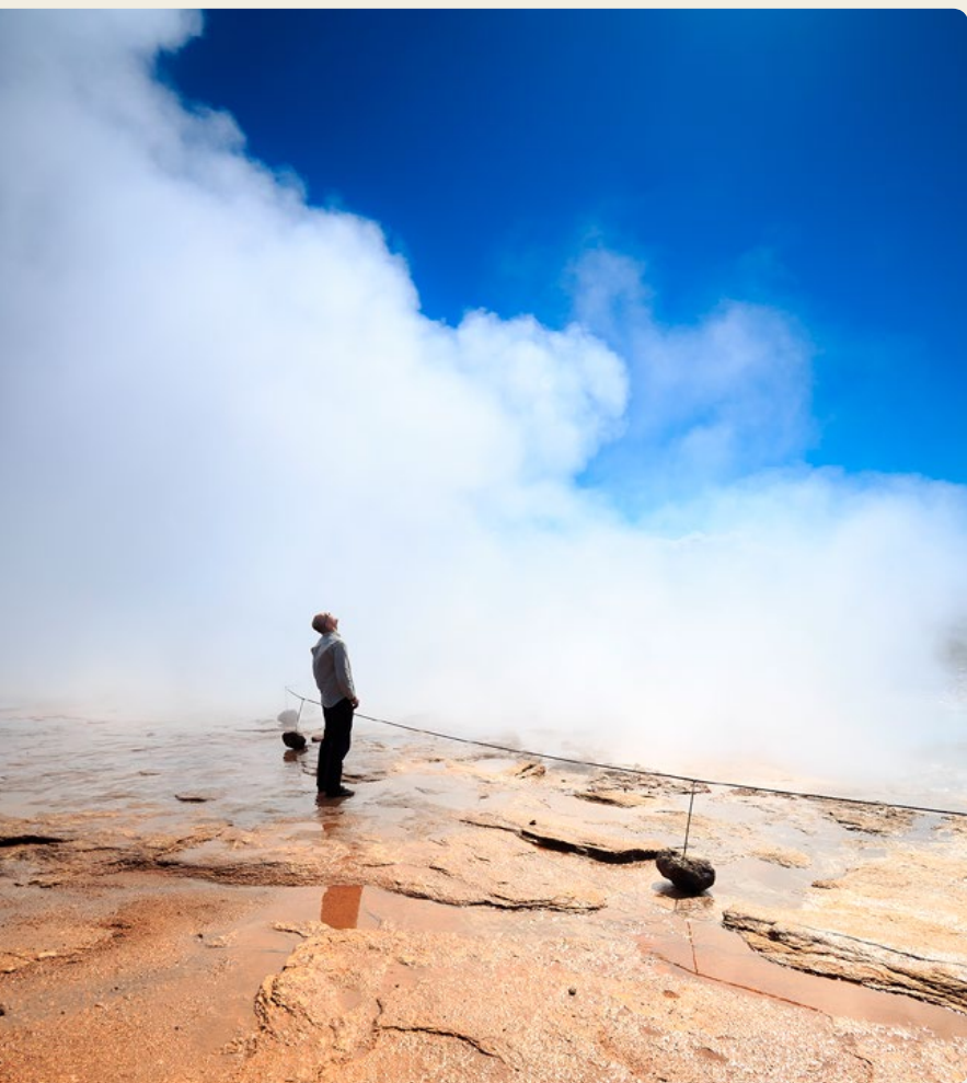
Great Geysir (p110), Geysir

between two brooding ice caps (and the site of the Eyjafjallajökull eruption in 2010) then down into Pórsmörk , a forested valley dotted with wild Arctic flowers. Or you can take a super-Jeep tour or amphibious bus to Pórsmörk, and then do day hikes around the valley. Those who are tighter on time can trek along the glacial tongue of Sólheimajökull instead.