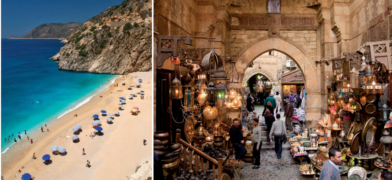
OPENING SPREAD Petra's dizzying, towering, rose-red rock walls. ABOVE (L) Too good to be true: Kaputa beach near Kas, Turkey. ABOVE (R) Cairo's bustling Khan al-Khalili (Great Bazaar). LEFT The sumptuous dome interior of the Hagia Sophia Church (Church of Divine Wisdom), Istanbul.

In Turkey, many overlanders cross the Sea of Marmara in a hurry to get to the coast. Meanwhile, travellers who only have eyes for Gallipoli journey down through Thrace to the Gallipoli peninsula. Both sets of adventurers miss out on Bursa, a key city on the original Silk Route and a wonderful stopover. It's easily reached from Istanbul and is a complete contrast to the coastal regions with a very Turkish feel. Bursa's big attraction, now and historically, is the thermal springs at Çekirge. The city is also famous as the place where the oh-so-savoury Iskender kebab was invented and as the birthplace of Karagöz shadow puppets.