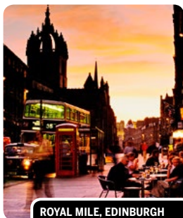
ROYAL MILE, EDINBURGH P773