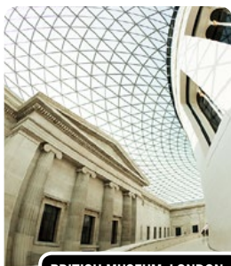
BRITISH MUSEUM, LONDON P103