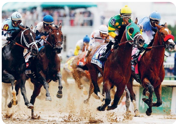
Churchill Downs Running of the Kentucky Derby (Trips 24 and 26)

Guided tours explain how Johnny Cash, Roy Orbison and Elvis became stars. See it on Trips 19 23 27 28