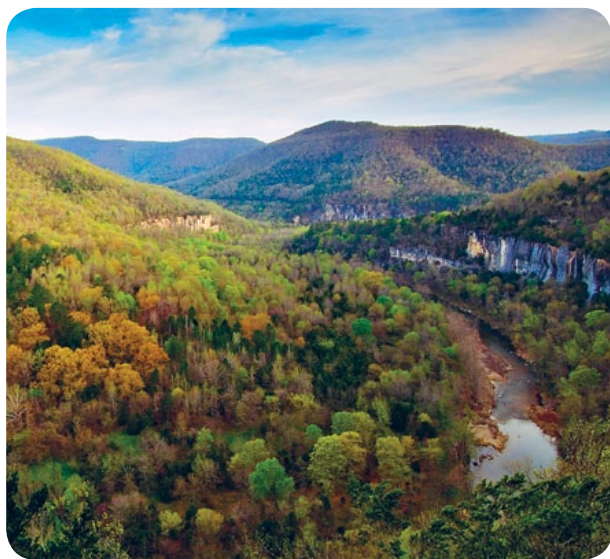
Buffalo River View from Steel Creek overlook (Trip 22)