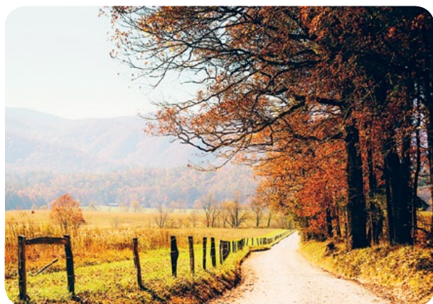
Great Smoky Mountains National Park The heart of the Appalachian Trail (Trip 15)

Unlike Alabama's other cities and towns scarred by oppressive history, Birmingham deftly balances its progressive present with its dark past. See it on Trip 14