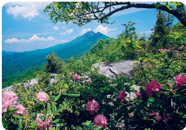
Grandfather Mountain Springtime flowers (Trip 6)

You'll spend more time than planned at this roadside market where the conversation is easy and the baked goods delicious. Visit on Trip 10