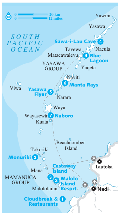
THE MAMANUCA & YASAWA GROUPS MAMANUCA GROUP

The Mamanucas are all about water sports and extreme relaxation. Whether you are staying for a week or visiting for a day, nonmotorised water sports (like snorkelling, windsurfing, kayaking and sailing in catamarans) are nearly always provided free of charge. However, the moment an engine is fired you can expect to be billed. Water-skiing, parasailing and wakeboarding cost about $120 for 15 minutes. Village trips or snorkelling on the outer reef cost between $20 and $40 per person, and reef-fishing trips average around $150 per hour for four people. Island-hopping tours cost anywhere between $80 and $180 per person, depending on how many islands are visited and whether lunch is included. But, whatever you do, don't forget your book – hammocks just aren't the same without one.