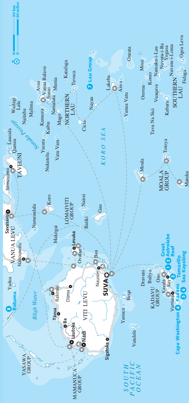
Cape Washington 4 Kadavu 5 6 Sea Kayaking