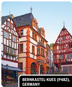
BERNKASTEL-KUES (P482), GERMANY