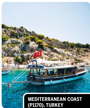
MEDITERRANEAN COAST (P1170), TURKEY