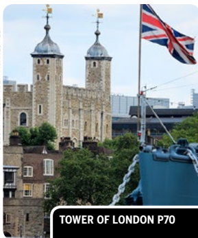
TOWER OF LONDON P70