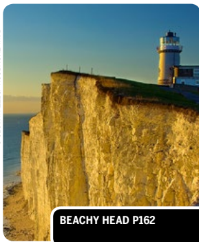
BEACHY HEAD P162