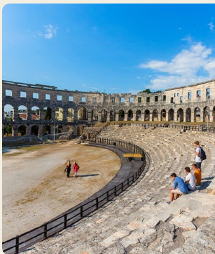
Top: Rovinj (p108) Bottom: Roman Amphitheatre (p101), Pula