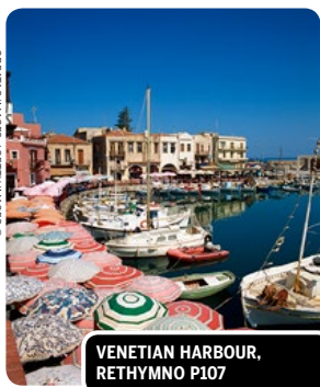
VENETIAN HARBOUR, RETHYMNO P107