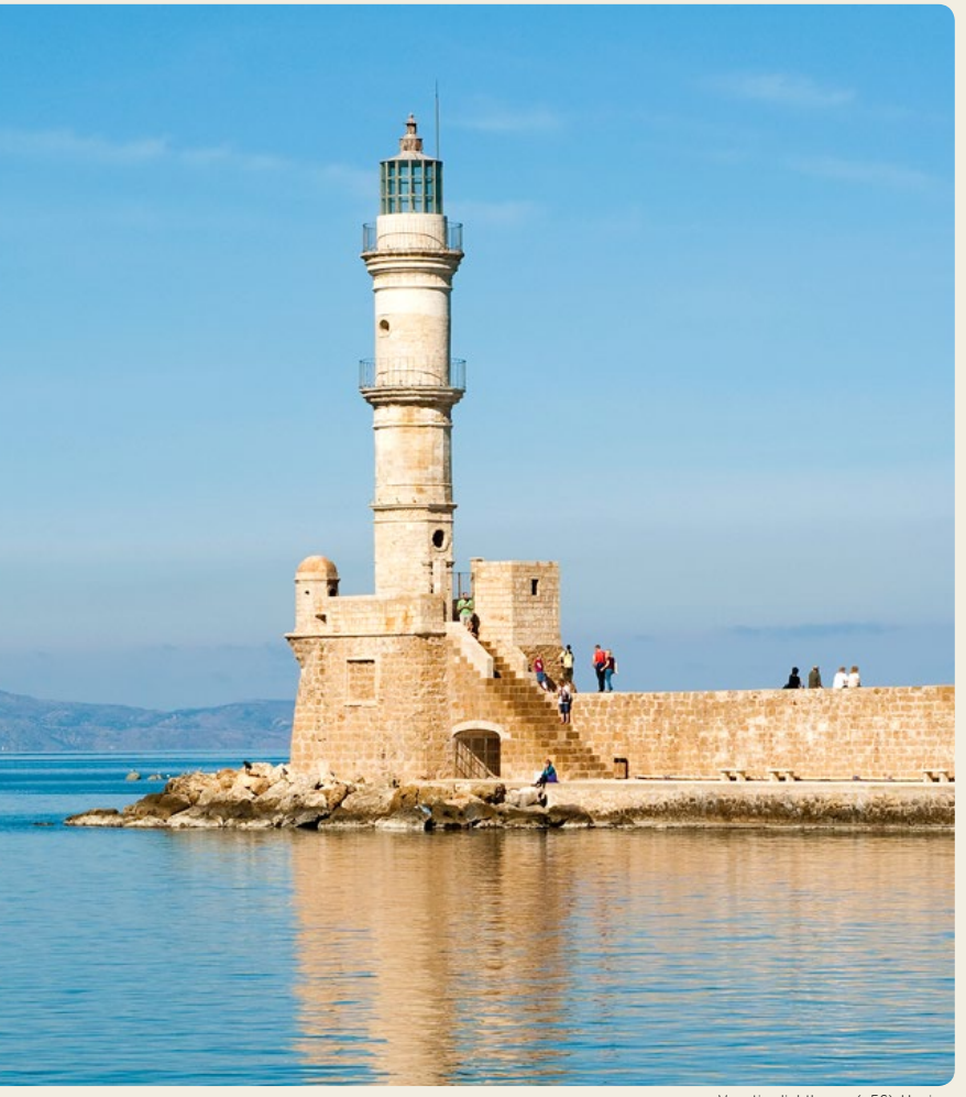
Venetian lighthouse (p56), Hania

Gorge) to Moni Preveli , a working monastery on a hill with sweeping views of the Libyan Sea, and picture-postcard Preveli Beach down below. Start week two by heading north to soulful Rethymno , where you can spend two days wandering the maze of Venetian lanes and another exploring the countryside, perhaps steering towards the pottery village of Margarites , the peaceful Moni Arkadiou , site of momentous historical events, or the cool natural spring oasis at the mountain village of Argyroupoli .