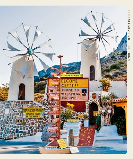
Top: Church of Panagia Kera (p198) Bottom: Traditional windmills, Lasithi Plateau (p202)