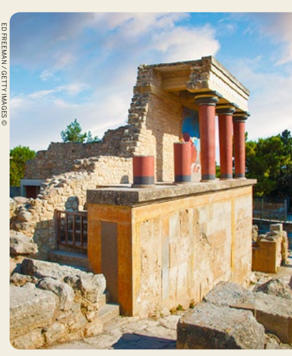
Top: Palace of Malia (p185) Bottom: Palace of Knossos (p157)