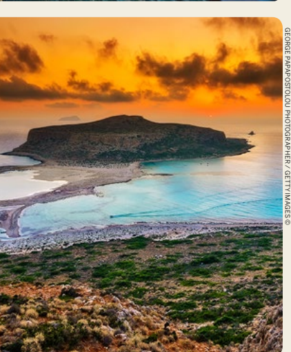
Top: Plakias (p127) Bottom: Balos beach (p99)