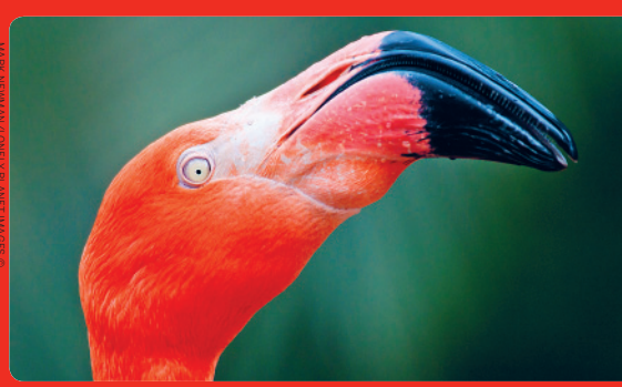
(left) Island in the Tobago Cays (p754), St Vincent & the Grenadines (below) The striking Caribbean flamingo

spot the accents of red orchids and yellow parrots.