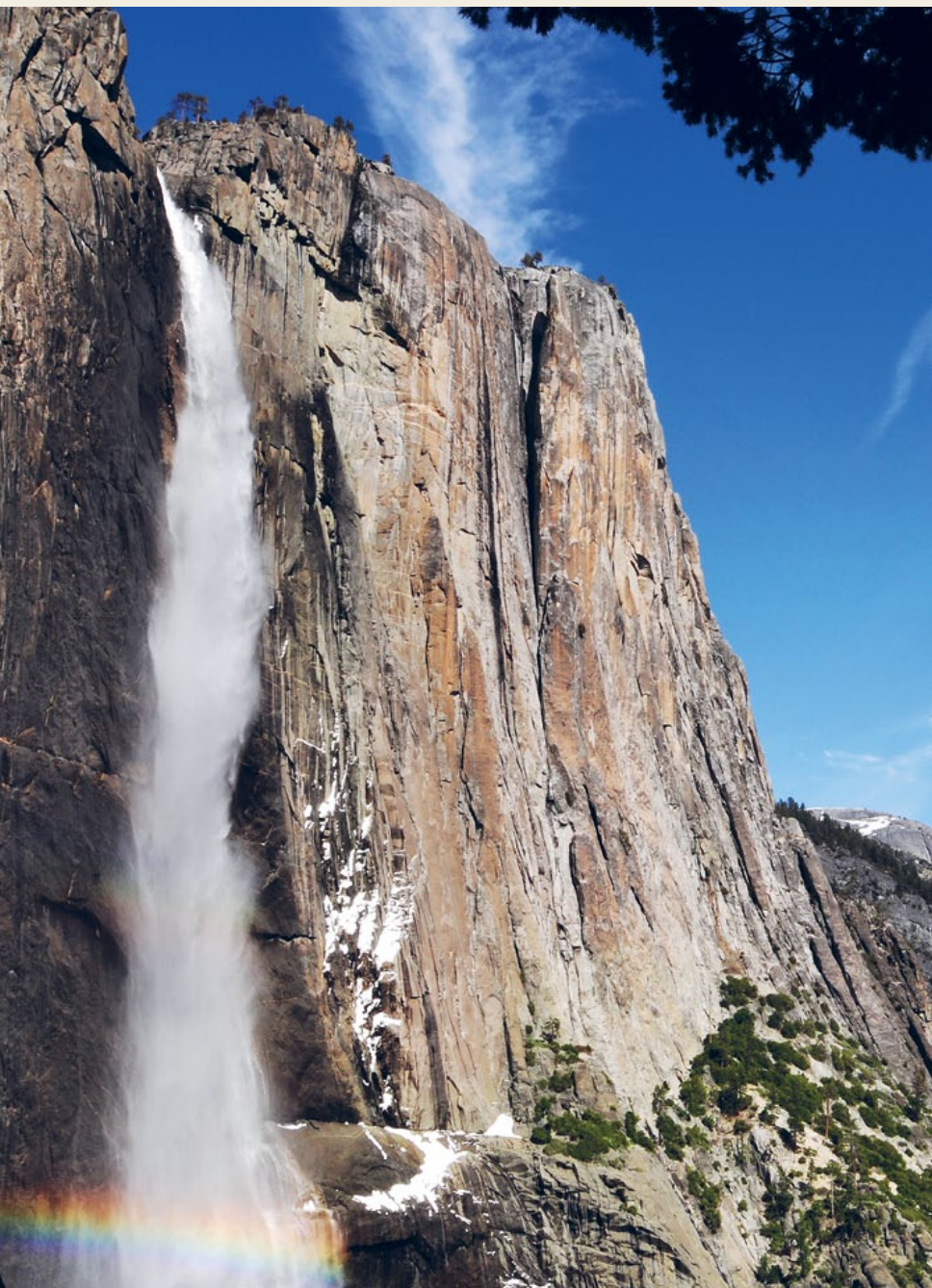
Yosemite National Park Waterfall (Trip 19)