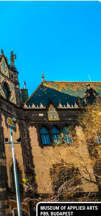
MUSEUM OF APPLIED ARTS P89, BUDAPEST