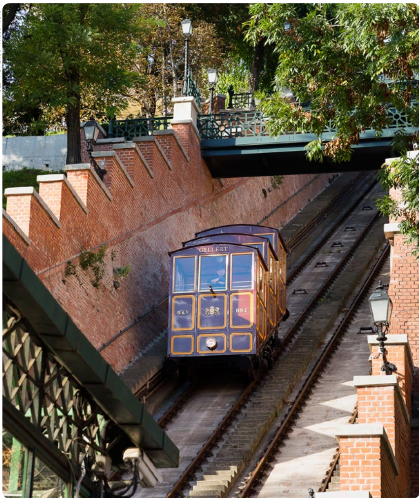
Top: Castle Hill Sikló (funicular), Budapest (p60)