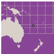
038 NEW CALEDONIA