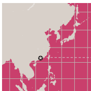
122 HONG KONG