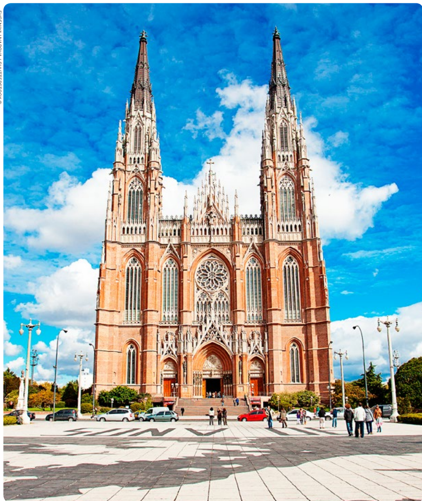
Top: Catedral de la Plata (p118)