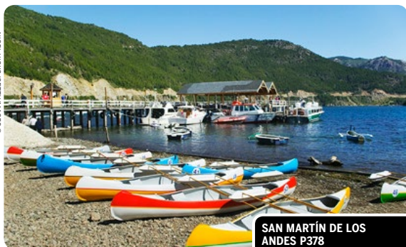
SAN MARTÍN DE LOS ANDES P378