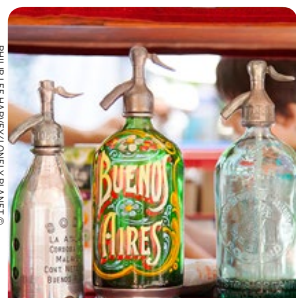
SAN TELMO, BUENOS AIRES P63