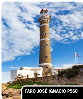
FARO JOSÉ IGNACIO P560