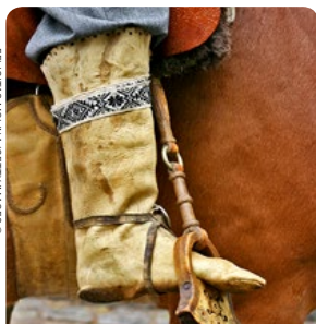
SAN ANTONIO DE ARECO P123