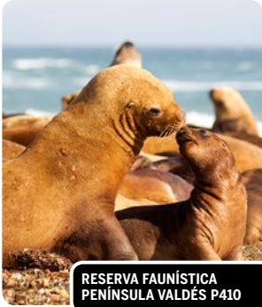
RESERVA FAUNÍSTICA PENÍNSULA VALDÉS P410