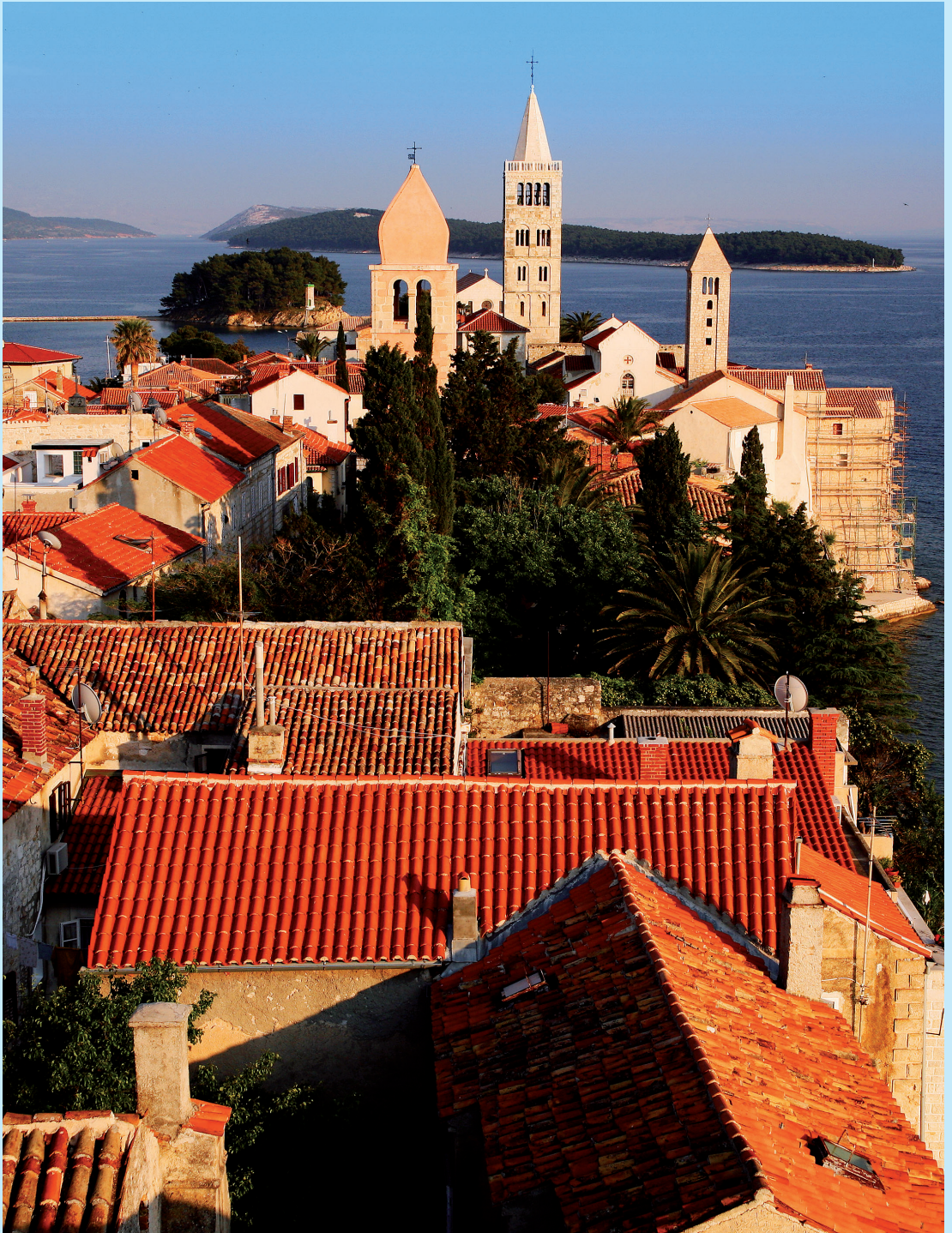
Gaze out to sea over the bell towers of medieval Rab, in Croatia.