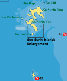
See Surin Islands Enlargement