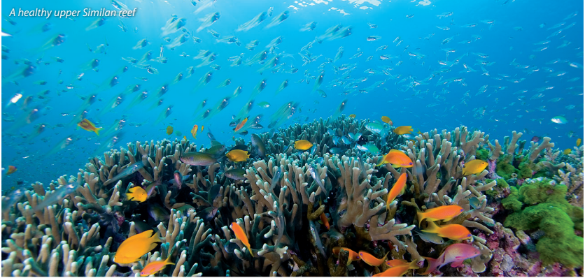
A healthy upper Similan reef