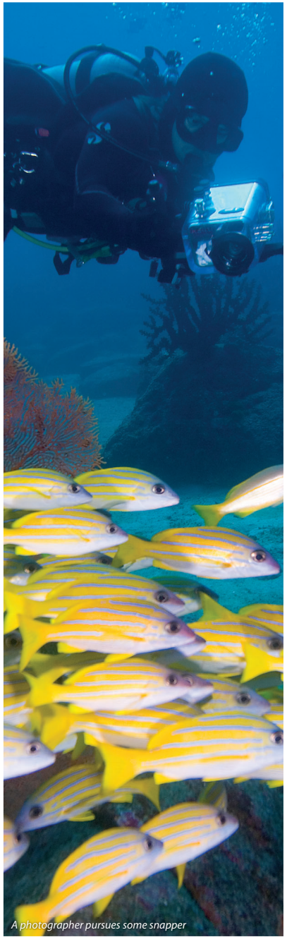
A photographer pursues some snapper