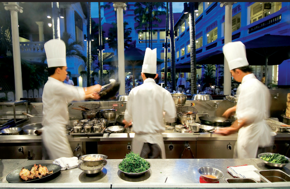
Chefs at Raffles Hotel (p124) indulging, sating, fuelling Singapore's greatest obsession: food

Always the bridesmaid and never the bride, this perennial stopover city is reinventing itself as a destination in its own right.